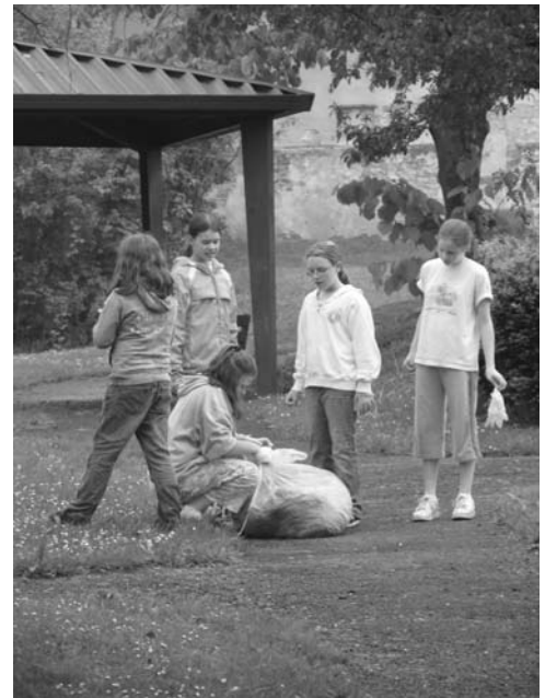
Girls from Troop 409 fill up yet another bag of garbage.